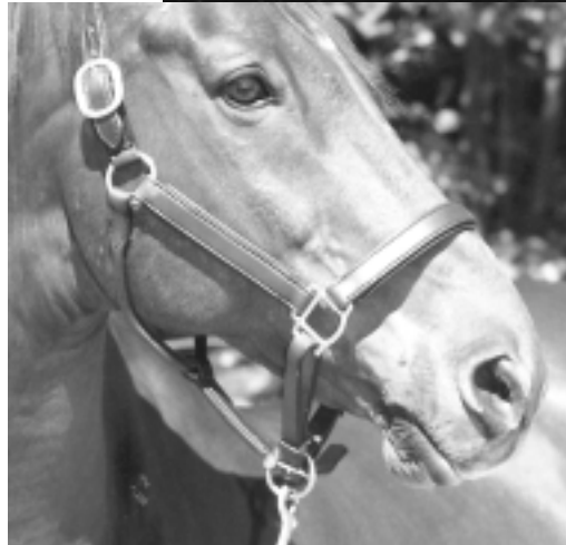
This halter is too big, but it could be fine if holes were punched in the noseband and the headstall were shortened.

shorten the headstall. Some halters have adjustable nosebands. However, they usually don't have enough holes to fit an average horse. So, you may need to use a hole punch for a comfortable and safe halter fit.