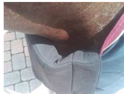
Using a bib and leaving slack in the front of the blanket keep shoulders more comfortable.

products strip coats of natural protective oils or they coat hair, which suffocates it and leaves it brittle to break.