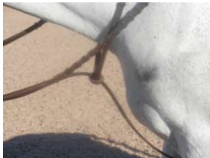
Healthy coats rarely sport bald spots like the one in this photo.

Good grooming not only stimulates and exfoliates to bring oils to the surface, but it fortifies the skin and nourishes the roots to strengthen hair. Proper grooming, with rhythm and muscle, tones both of you as well as carries oils down the hair shaft to close the cuticle. Clipped coats have no shine when the cuticle is open. If horses are consistently well groomed, they often don't look clipped. The hair is finer. They shine, because the skin was really healthy and clean before being exposed. Then, grooming closes cuticles and the strands are sealed. This makes coats look