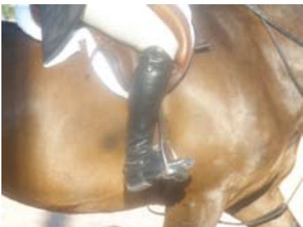
Rubs are saying something about your leg, care and products.

great. Winter grooming also defends horses against the elements. Oils help keep horses warm, dry and comfortable, so groom thoroughly daily and before and after work.